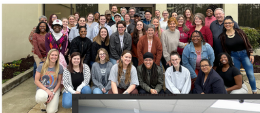
Counseling and Rehabilitation Recovery, Resilience, and...