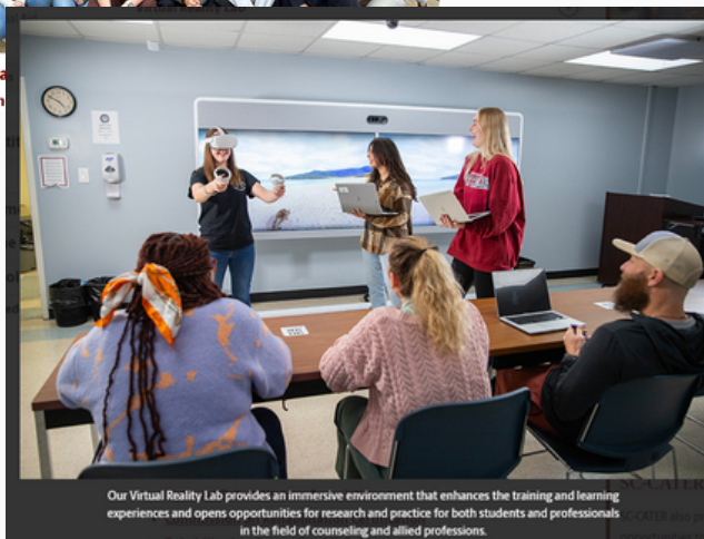
Our Virtual Reality Lab provides an immersive environment that enhances the training and learning experiences and opens opportunities for research and practice for both students and professionals in the field of counseling and allied professions.