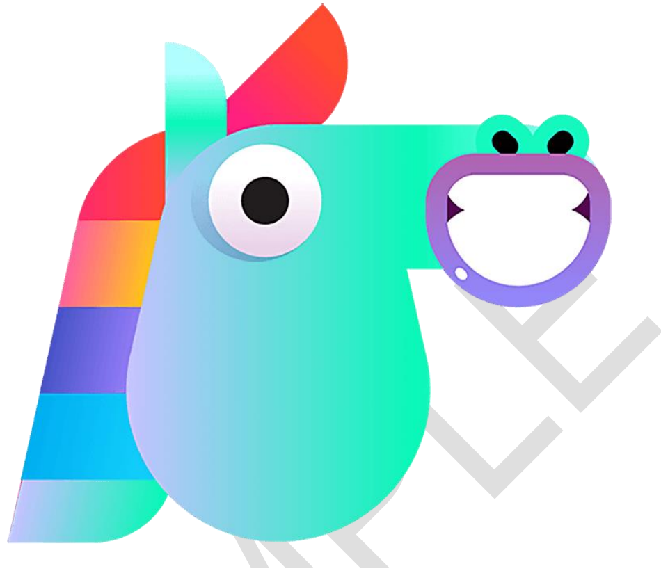
Figure 3.2 Image of colorful unicorn

Notes: Lorem ipsum dolor sit amet, consectetur adipiscing elit. Maecenas porttitor congue massa. Fusce posuere, magna sed pulvinar ultricies, purus lectus malesuada libero, sit amet commodo magna eros quis urna. Nunc viverra imperdiet enim.