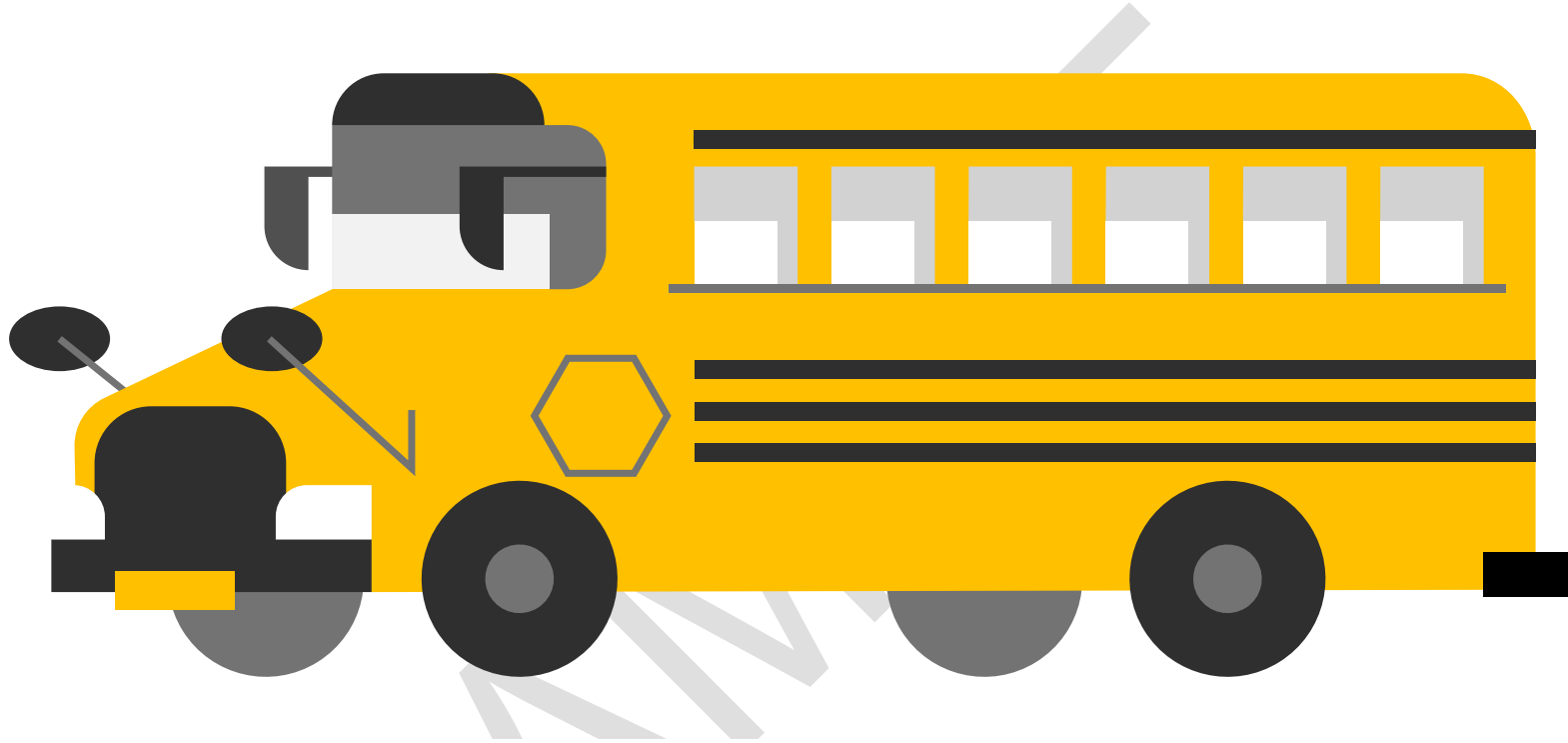
Figure 3.1 Large image of a school bus

Notes: Lorem ipsum dolor sit amet, consectetur adipiscing elit. Maecenas porttitor congue massa. Fusce posuere, magna sed pulvinar ultricies, purus lectus malesuada libero, sit amet commodo magna eros quis urna. Nunc viverra imperdiet enim. Fusce est.